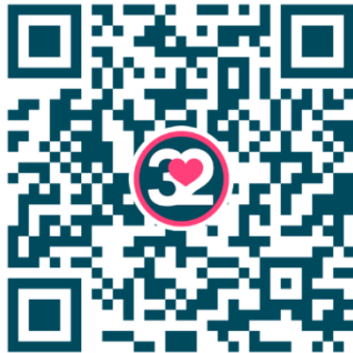
Scan for the silent auction

The event will be held in person, but bidding will be done online so please bring your device with you to bid. The museum has wi-fi for your convenience. The auction website will be www.32auctions.com/OTW2026