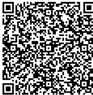
Scan for OTW tickets