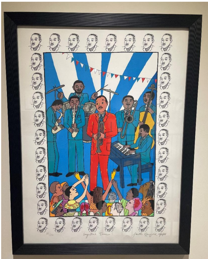
Faith Ringgold, Wynton's Tune , Color lithograph, Courtesy of the Sutton Collection