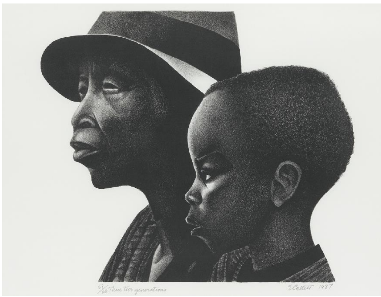
Elizabeth Catlett, These Two Generations , Lithograph, 1987