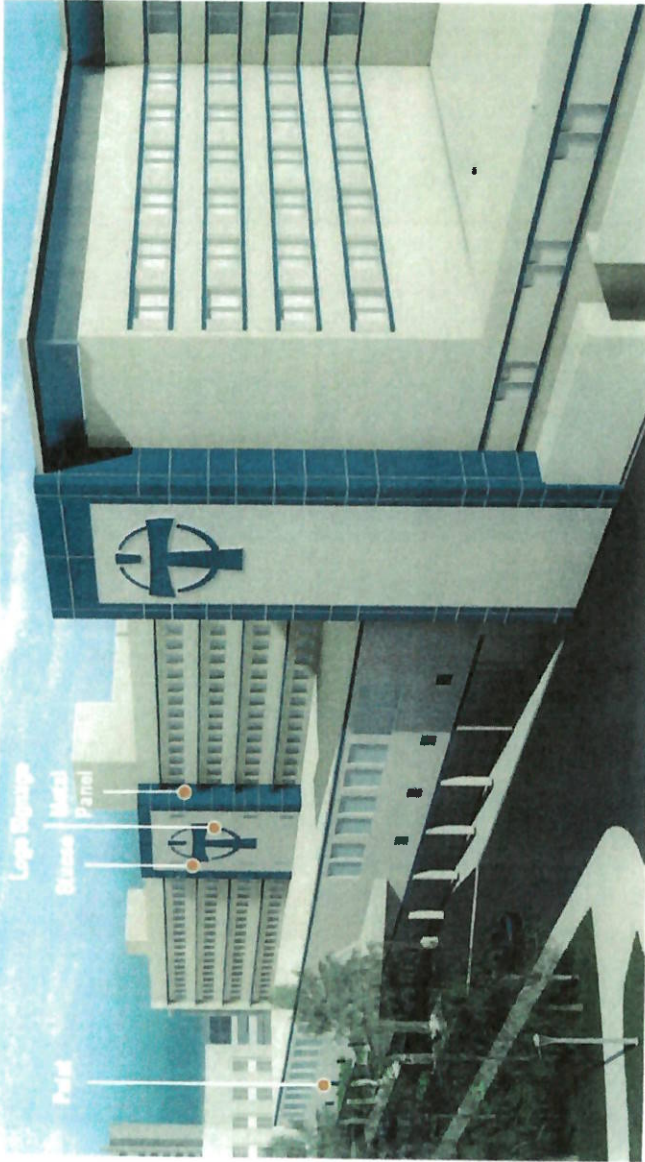
Figure 4X - Jackson St Facade Improvement