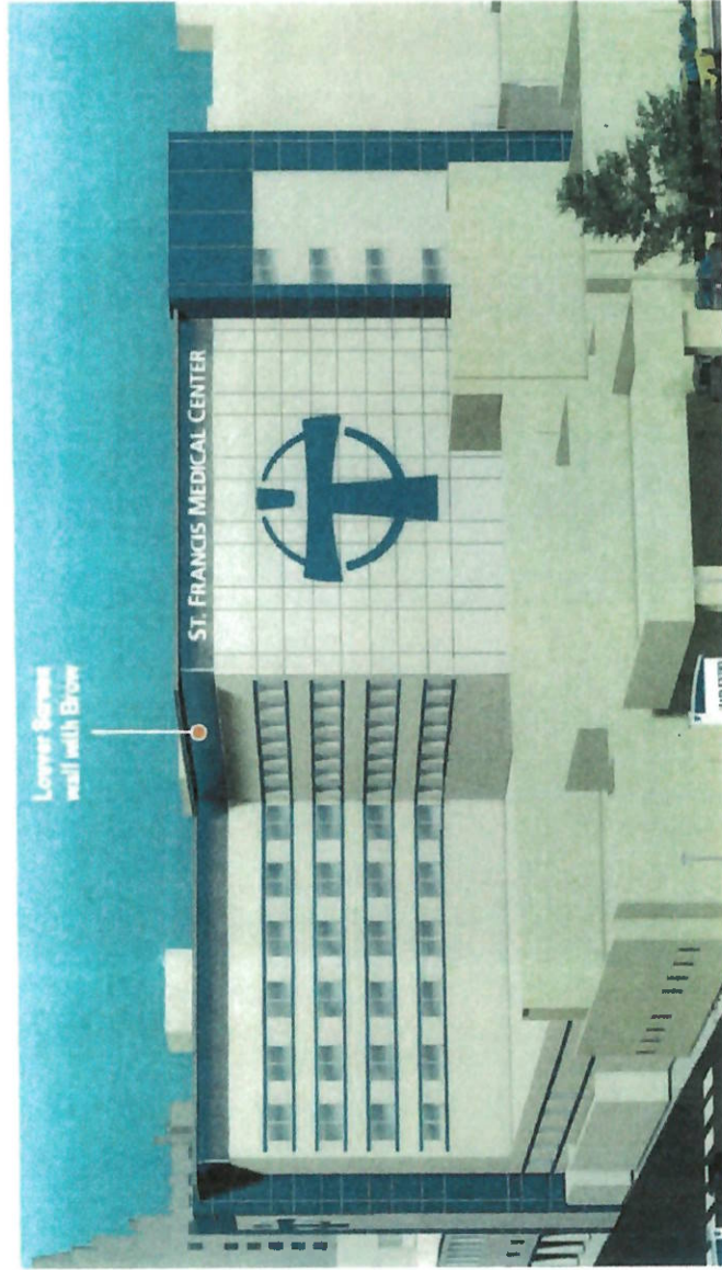
Figure 4W Preferred Façade Improvement

Capital Cost Placeholder of $1,500,000 to $1,850,000