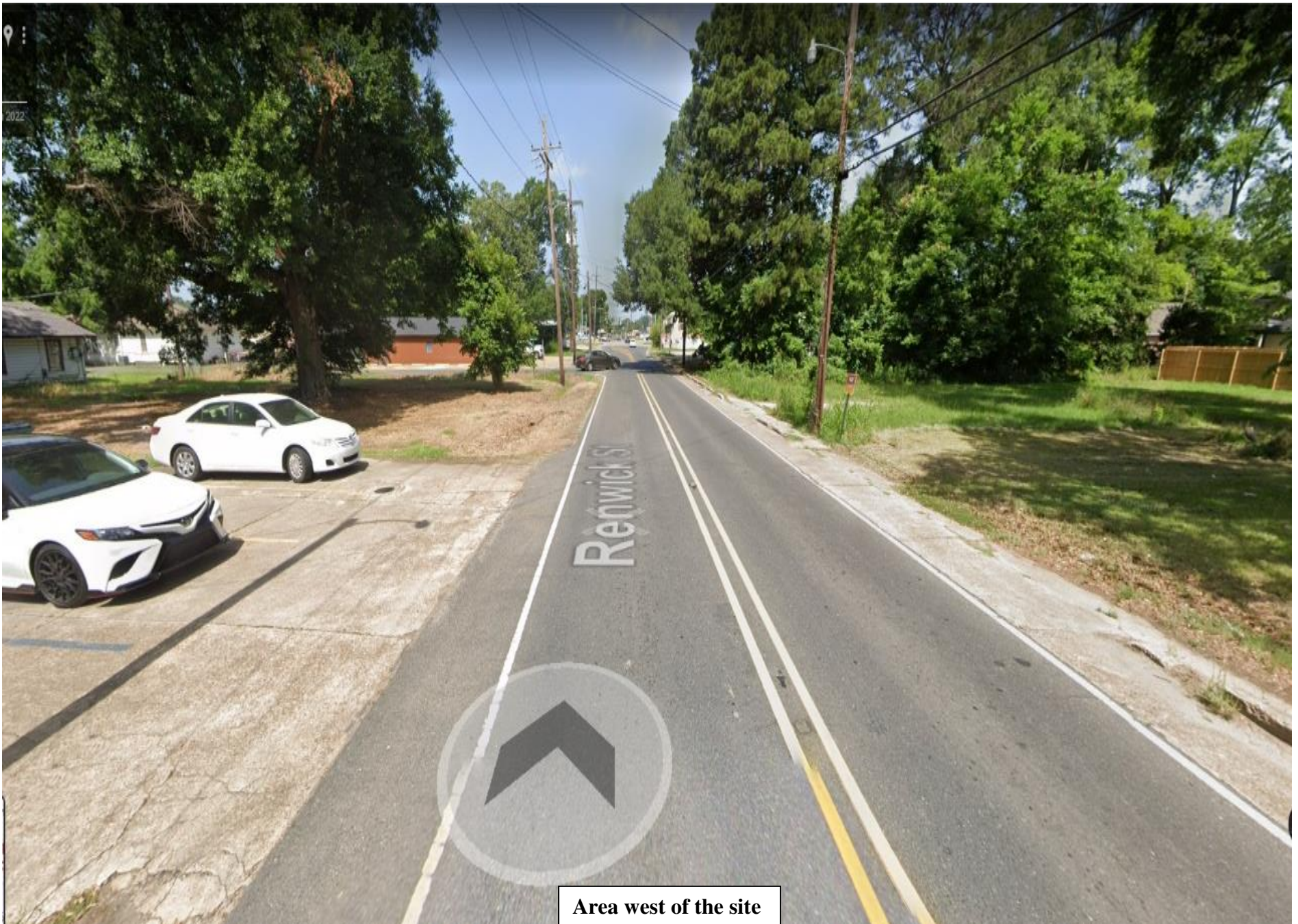
Area west of the site