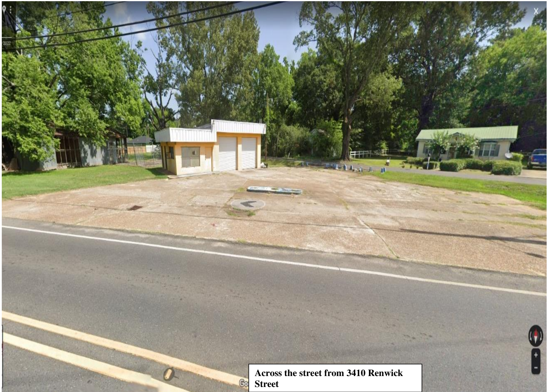
Across the street from 3410 Renwick Street