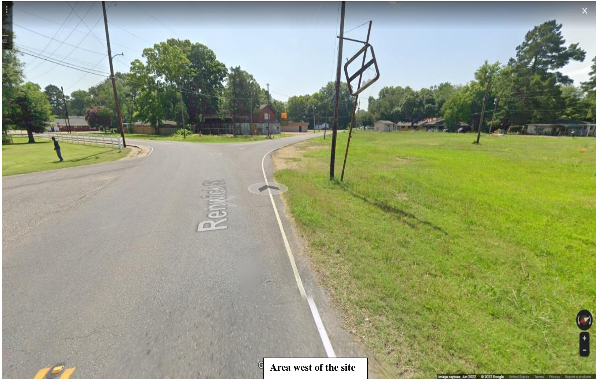
© Area west of the site