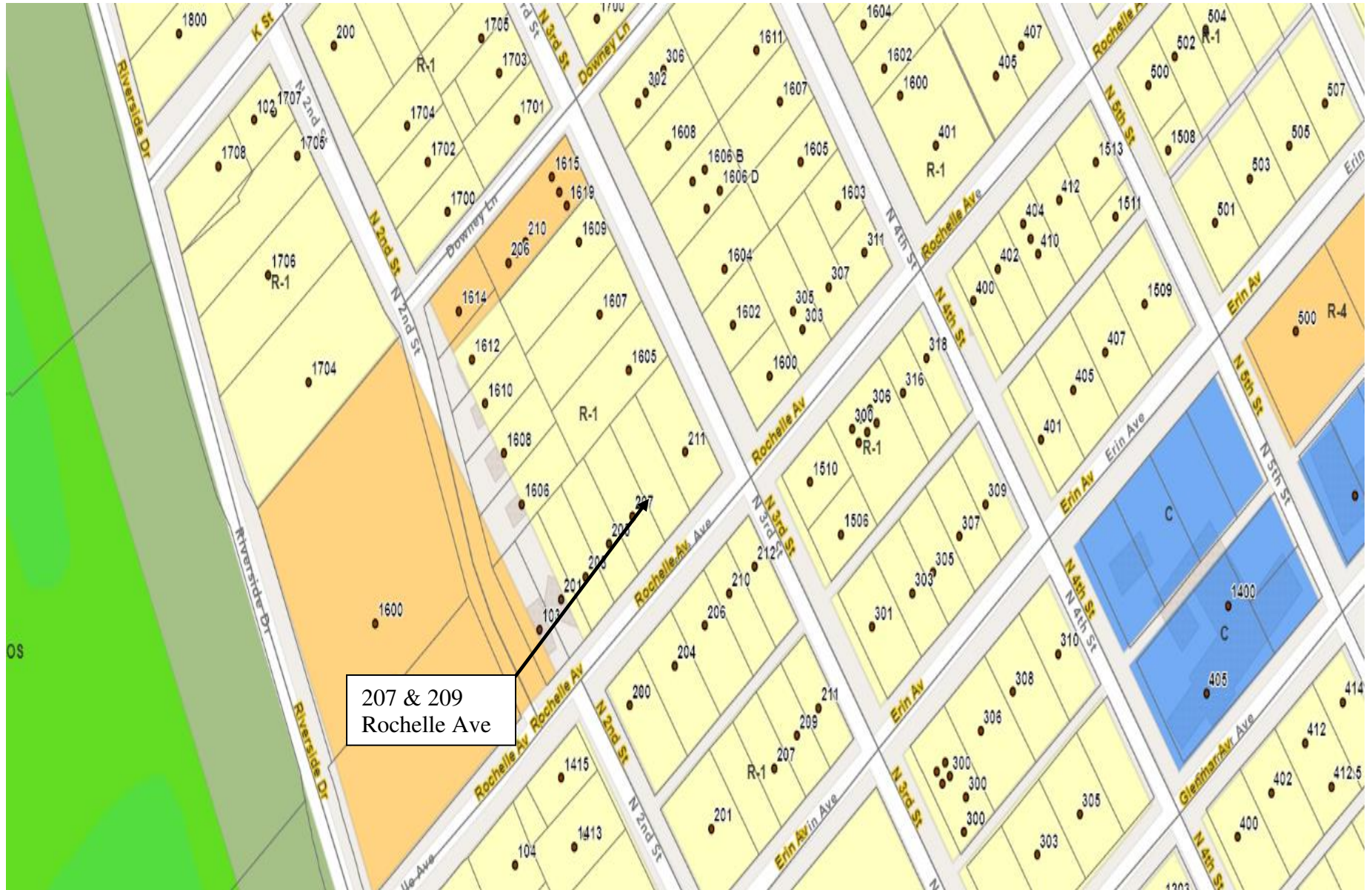
IMAGE OF ZONING AND SITE IS LOCATION